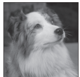
Emma - Age: 2.5

How mathematical am I? Master of angles in catching up to and herding other dogs who are faster.