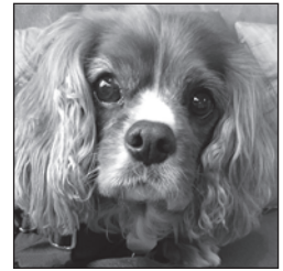
Robbie - Age: 9