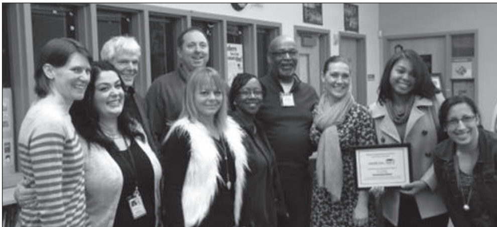
Former Mayor Norm Rice with staff from Madrona K-8

recognizes an individual who has made extra and extraordinary efforts for the education and growth of Madrona K-8.