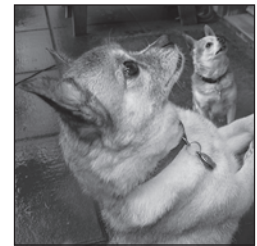
Pear & Paco - Ages: 11 & 12

How mathematical am I? Pear: I walk as many miles as possible on walks. Paco: I want the temp to be as many digits as possible.