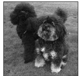
Valentino & Grover